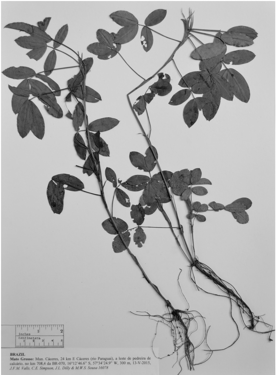
Fig. 1. Arachis jacobinensis Valls & C.E. Simpson. Plant habit, showing tall main axis (Type collection: Valls et al. 16078).