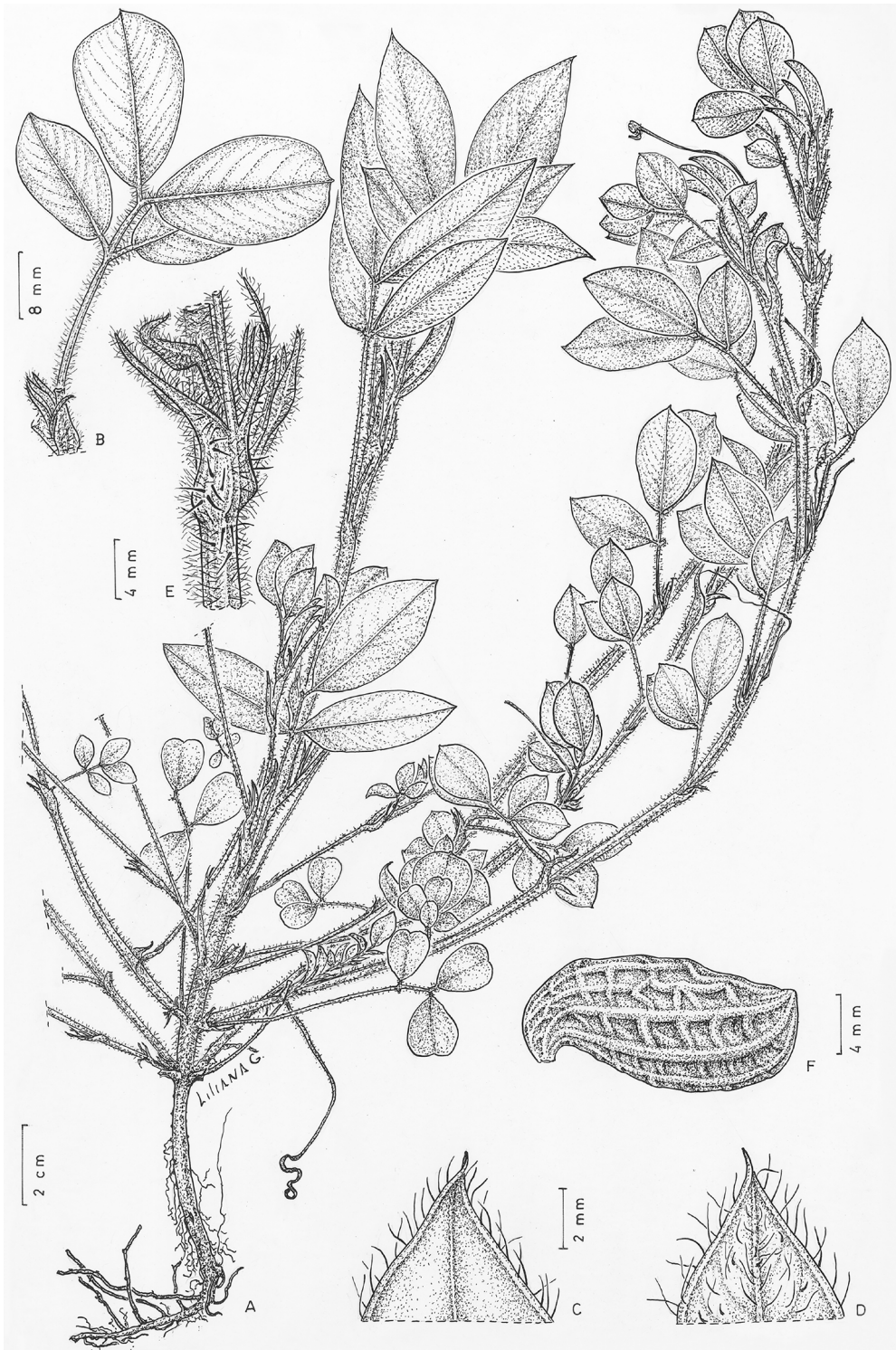
Fig. 1. Arachis woodii . A: Main axis and lateral branches of a young plant. Note a vertical peg close to the main axis. B: Leaf with stipules. C: Details of the upper surface of a leaflet apex. D: Details of the lower surface of a leaflet apex. E: Details of the stipules and stem. F: External view of the fruit, with a pronounced beak and the exocarp with deep reticulum. A-F: Atahuachi et al. 1469 (CTES), drawing by Liliana Gómez.