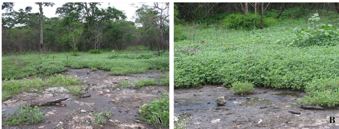
Fig. 3. Environment where Arachis woodii lives. A: Panoramic view of the habitat of the population in open patches of deciduous forest. B: Detail of the dense population inhabiting shallow black soil on rock outcrops.

the soil type of A. woodii is more similar to that of some populations of A. glandulifera (Seijo et al. 3000, 3222, and 3622) from South Concepción, in Ñuflo de Chavez province, Santa Cruz department, which lives in pockets of shallow sandy-clayey soil on rock outcrops.