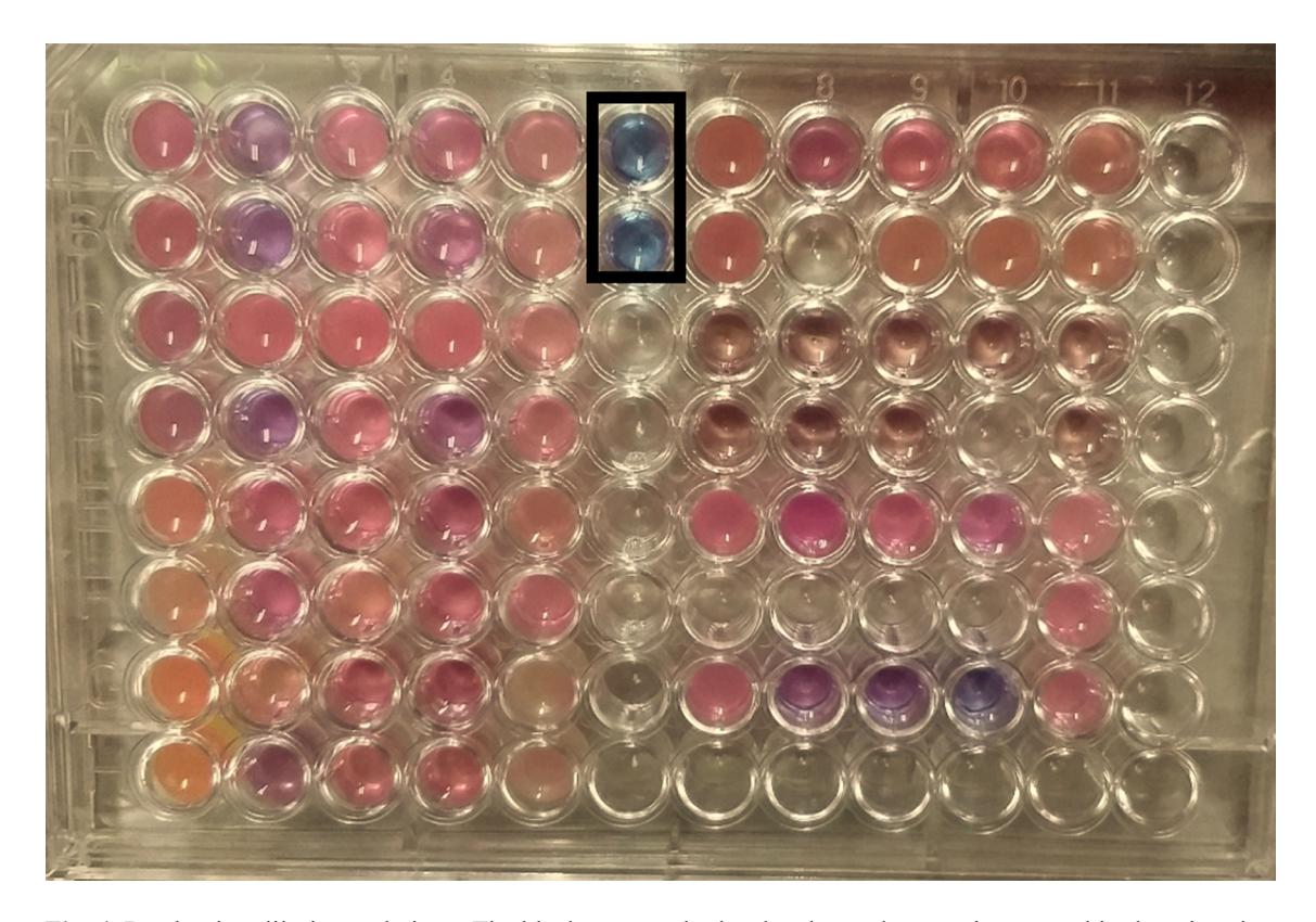
Fig. 4. Broth microdilution technique. The black rectangular border shows the negative control in the microtiter (6A and 6B). Columns 1 and 7 are inoculated with Ralstonia solanacearum , 2 and 8 with Pseudomonas syringae pv. tomato, 3 and 9 with Xanthomonas citri subsp. citri, 4 and 10 with Xanthomonas axonopodis pv. manihotis. Microtiter cells: protein isolates from Ananas comosus stem (1A to 5A and 1B to 5B), protein isolates from Ananas comosus leaves (1C to 5C and 1D to 5D), protein isolates from Bromelia serra leaves (1E to 5E and 1F to 5F), Commercial bromelain (7C to 11C and 7D to 11D). The rest of the remaining cells are repetitions from the protein isolates.

Abbreviations : AC.: Ananas comosus , BS: Bromelia serra , *Treatments had no growth inhibition against all tested bacteria. Concentration tested: BS leaf isolate (0.88, 0.44, 0.22, 0.11, and 0.06 mg/mL); AC leaf isolate (0.39, 0.19, 0.10, 0.05, and 0.02 mg/mL); AC stem isolate (0.95, 0.47, 0.24, 0.12, and 0.06 mg/mL); commercial bromelain (0.088, 0.044, 0.022, 0.011, 0.006, and 0.003 mg/mL).