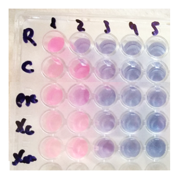
Fig. 3. Selection of the initial cell concentration using 0.01% resazurin solution. Ralstonia solanacearum (R), Clavibacter michiganensis subsp. michiganensis (C), Pseudomonas syringae pv. tomato (Pse), Xanthomonas citri subsp. citri (Xc) and Xanthomonas axonopodis pv. manihotis (Xm). Numbers 1 to 5 represent the concentration of a ten-fold dilution of bacteria.

The results of the broth microdilution technique (Table 2) showed no growth inhibition of any of the tested bacterial species exposed to the different protein isolates or commercial bromelain (Pink, mauve colors), at all the tested concentrations (BS leaf isolate: 0.88, 0.44, 0.22, 0.11 and 0.06 mg/mL; AC leaf isolate: 0.39, 0.19, 0.10, 0.05 and 0.02 mg/mL; AC stem isolate: 0.95, 0.47, 0.24, 0.12 and 0.06 mg/mL; commercial bromelain: 0.088, 0.044,