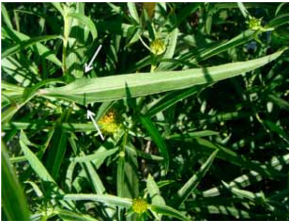
Figure 1. Leaves of Wedelia glauca . Basal teeth are shown with arrows.

Sometimes, it is possible to find fragments of plants in the rumen content 21 . The dermis of the plants does not undergo significant changes in spite of the mechanic and enzymatic activity occurring in the rumen. This allows the identification of such structures by means of optical microscopy, a method known as micrography or micrographic analysis.