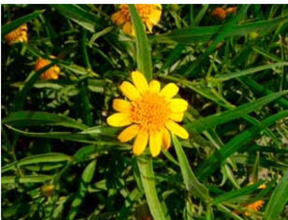
Figure 2. Inflorescence of Wedelia glauca .

The macroscopic and microscopic anatomopathologic findings of an accidental poisoning case with Wg confirmed by micrographic analysis of plant parts found in the rumen contents and the bales used to feed animals are presented in this paper.